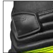
HAIX® Ankle Protector System