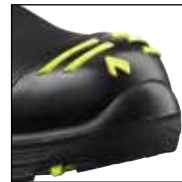
HAIX® High Durability Cap System