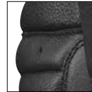
HAIX® Climate System